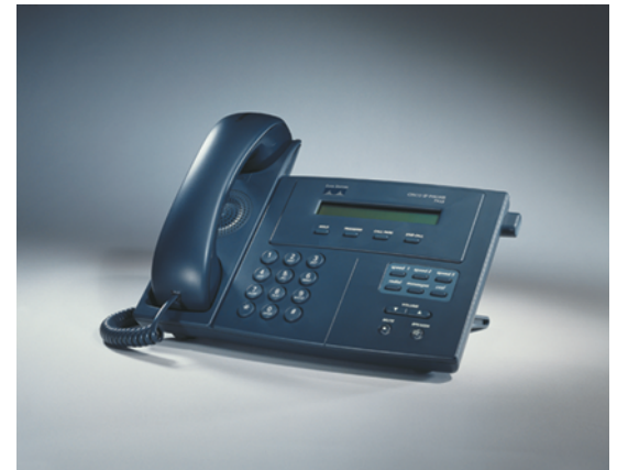
Figure 1 Cisco IP Phone 7910G and 7910G+SW

such as Call Park, Call Pick-Up, and Night Service, as well as additional speed dials and other traditional telephone features.