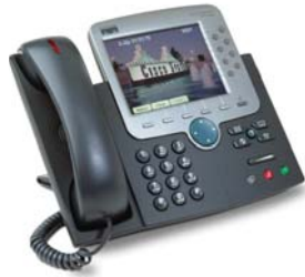
Cisco 7970 IP Telephone (Optional Equipment available for an additional charge)