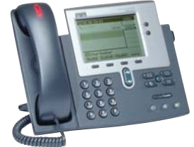
Cisco 7940 IP Telephone