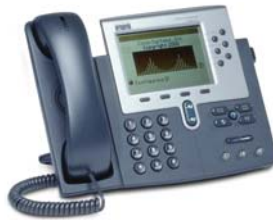
Cisco 7960 IP Telephone